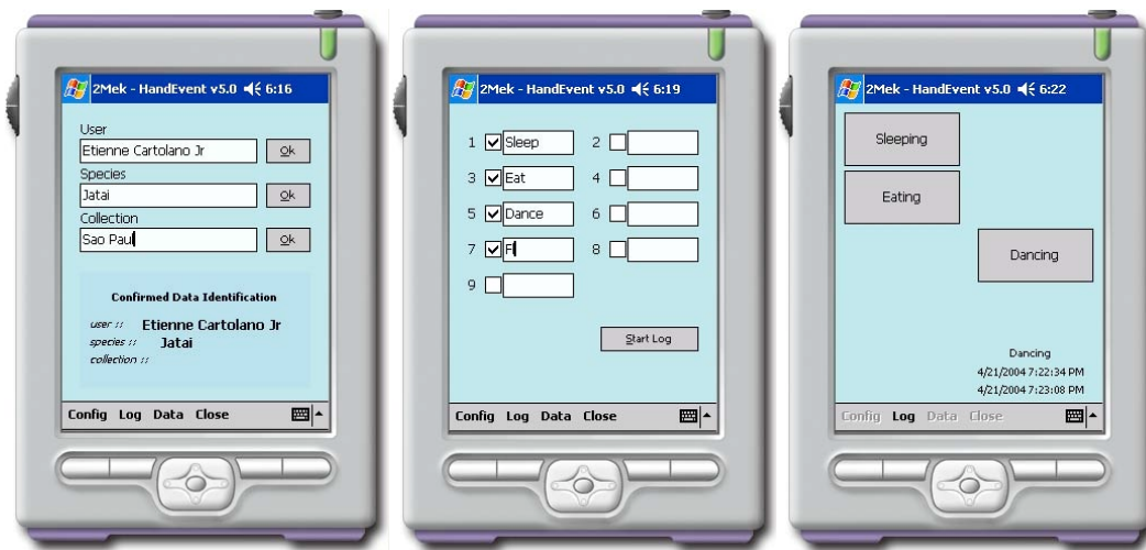
Fig. 1. Screens for configuring user name and event definition (left), for configuring buttons name (center) and for datalogging (right).